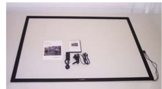
Simple installation process - 15 minutes from start to finish (installation guide available)